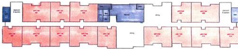
Fourth Floor Plan

Independent Senior Living Center, Montevallo, AL Wolfe Architect, Inc. Tampa, Florida