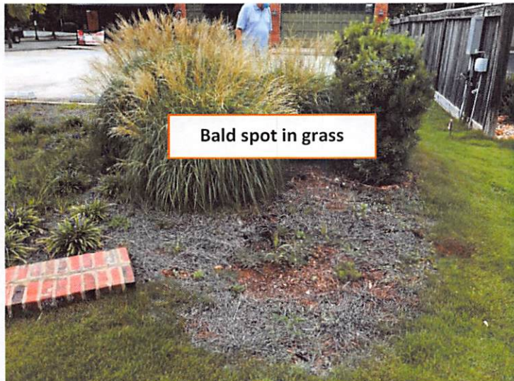
Bald spot in grass