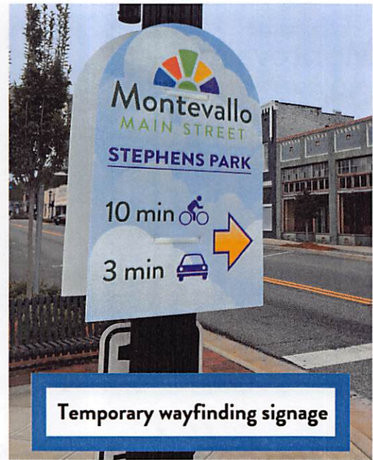
Temporary wayfinding signage