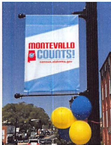
Census Banners in partnership with County