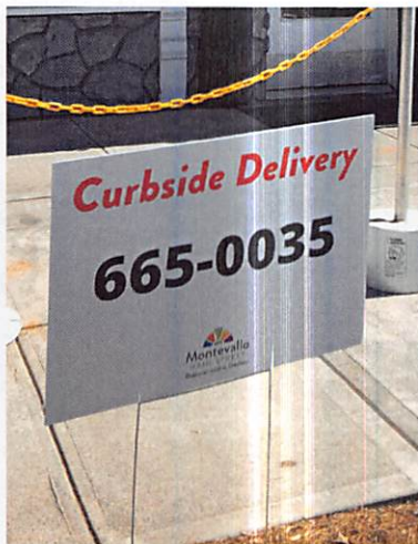
Curbside Pickup Signs (COVID Response)