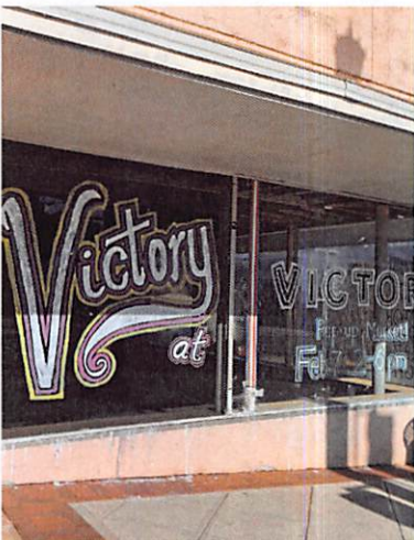
Victory at Victory Art Walk Pop-Up