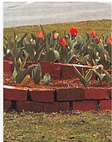
Bring the Festival of Tulips Downtown